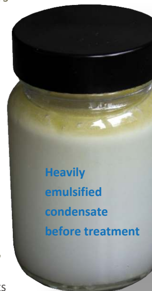
Heavily emulsified condensate before treatment

Stable emulsions present a challenge to any oil/water separator, but STERLING ® Active Filter units are up to the job. With an active biological component that actually digests oil, the CSR 'AF' range is the answer to problem condensates