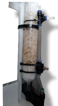
Filter media on test in the STERLING ® laboratory