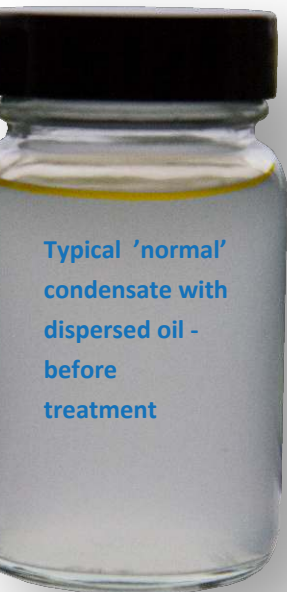
Typical 'normal' condensate with dispersed oil - before treatment

The STERLING ® CSR separator is designed to clean 'normal' dispersed condensates from almost all compressor systems that run on mineral or mineral-based lubricants - giving outlet quality of better than 20ppm from installation through to end-of-life. That's up to 4000 running hours